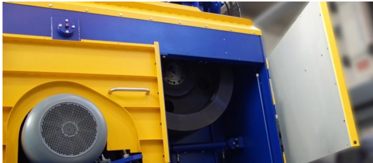
Fig. 2) Easy access