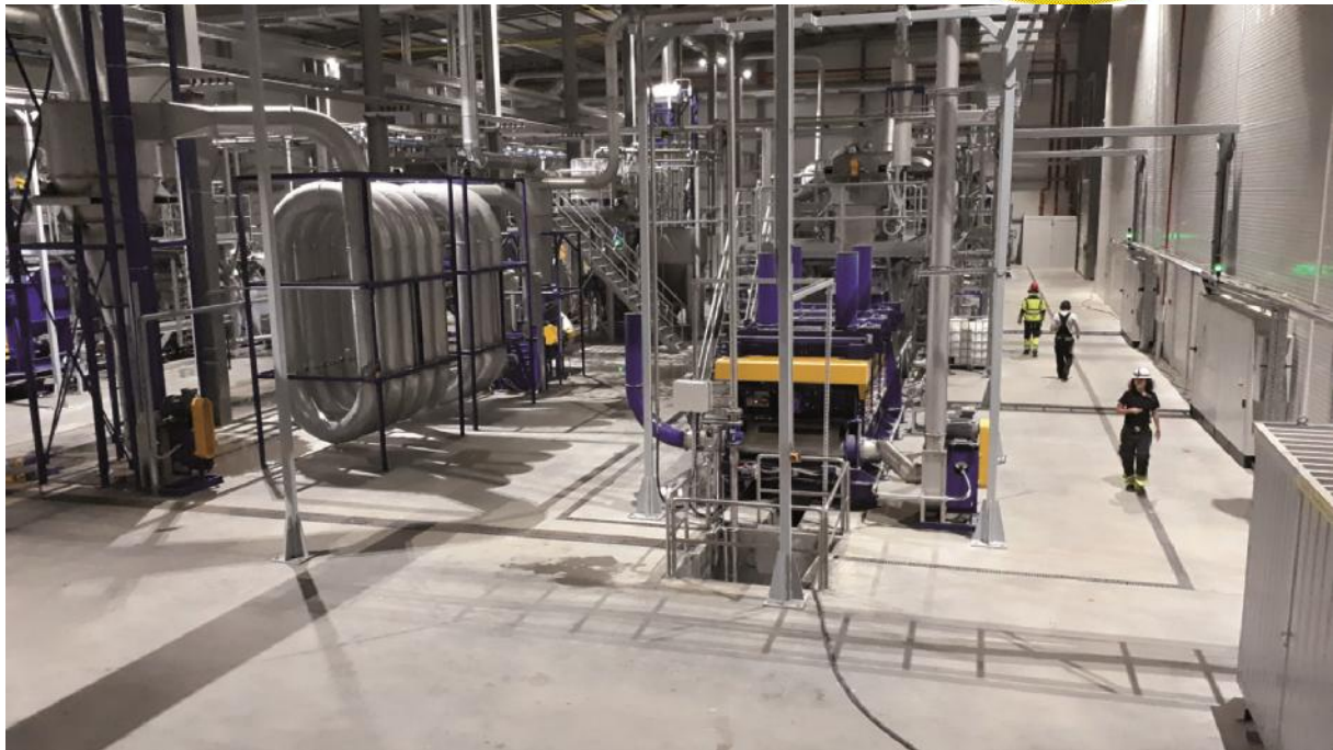
Fig. 5) Modern film washing lines with hot washing

We focus on providing our customers with comprehensive consulting, stated Achim Ebel – Division Manager for washing lines. For this reason, we look closely at the planned input quantities and compositions, but at the same time keep an eye on the desired applications for the washed end products. We do not offer washing lines off the shelf – designing a solution that meets the particular requirements is a more intensive individual process performed together with the customer.