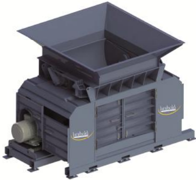
Fig. 1) Herbold EWS 60/210