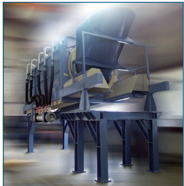
Fig.2: Pre-wash drum