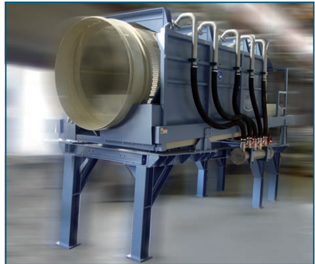
Fig.1: Pre-wash drum

Our pre-wash drum is able to average approximately 8 t/h, suitable for pre-treatment at the entrance of the plastic washing facility. The subsequent steps of removing contamination, wet shredding, washing, separation, and drying are improved by removing contamination up front.