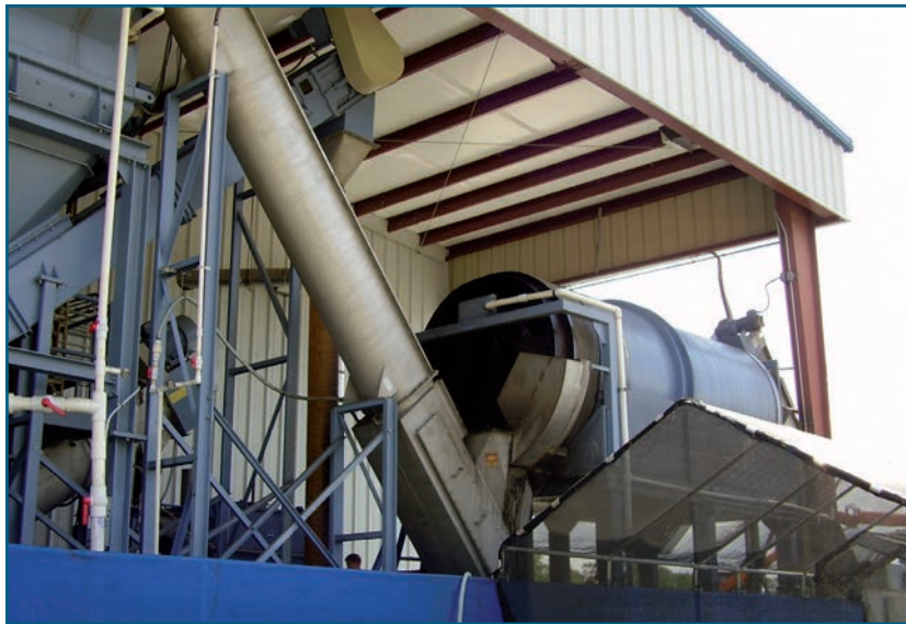
Fig.5: Agricultural film wash drum with feeding screw