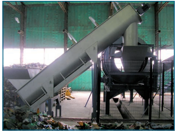
Fig.4: PET wash drum with upstream feeding screw