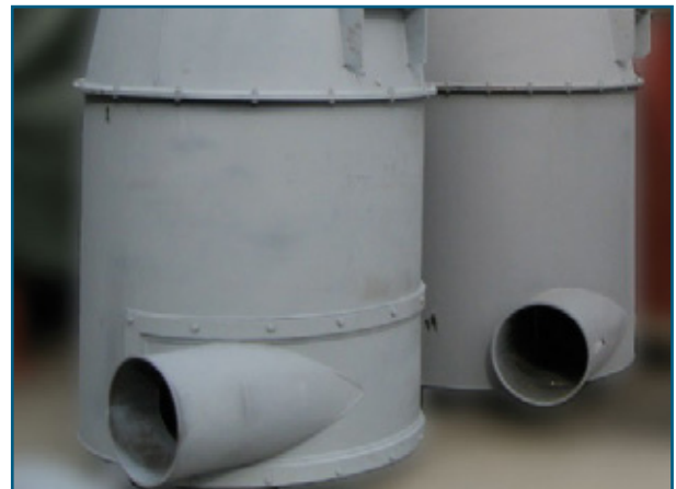
Fig. 4: The cyclone separator is available with and without exchangeable wear components.