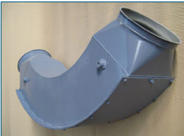
Fig. 2: These elbows feature exchangeable wear protection plates and allow the elbows to last longer and be used again.