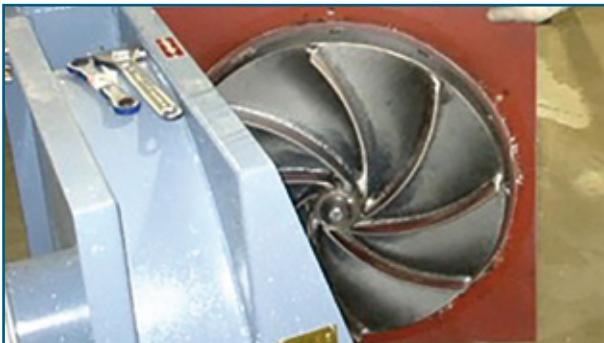
Fig. 7: The impeller has curved paddles that reduce wear and tear and prevent additional size reduction in the blower. Also available in heavy duty steel in the EHST series.