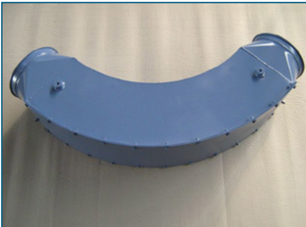
Fig. 1: The Herbold wear-resistant pipe elbows are prone to less wear than a traditional pipe elbow due to the larger radius.