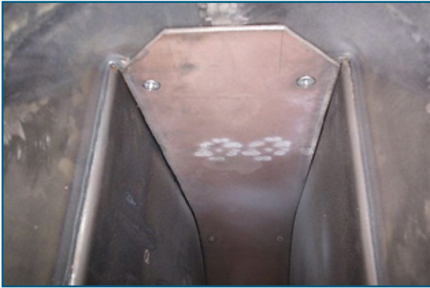
Fig. 5: The blowers are equipped with an exchangeable wear insert ...