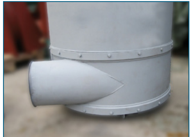
Fig. 3: Herbold also offers cyclone separators equipped with replaceable wear components .