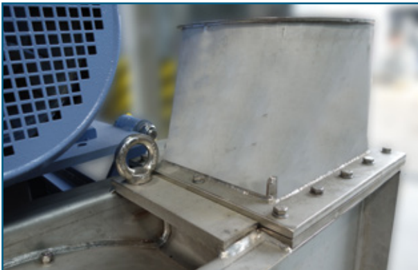
Fig. 6: ... as well as with exchangeable suction and pressure nozzles.