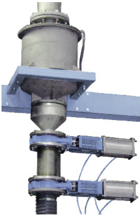
Heavy medium hydrocyclone