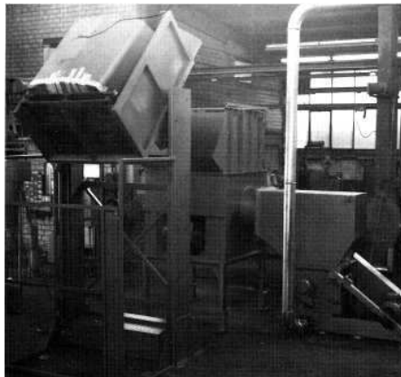
Central granulator for the reduction of sprues

Recycling on-line directly beside the machine is not always possible or practicable. The direct mixing of ground material with the raw material is not always possible, neither is it always possible to reintroduce the ground material immediately without an intermediate processing step (separation of fine particles, for example).