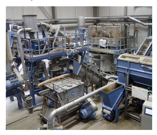
Fig. 7: Technical lab

9. HERBOLD Meckesheim has introduced a customer portal, http://myherbold.com where customers can access important information such as operator manuals, spare parts listings, and arrangement/electrical drawings for their specific machines. This portal can also be used to inquiry about pricing and available spare parts.