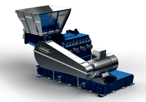
Fig. 1: SMS Granulator of the SB series with forced feeding

1. Our machines and plants are powerful and competitive and our technology is always improving. The machines have a high resale value over many years.