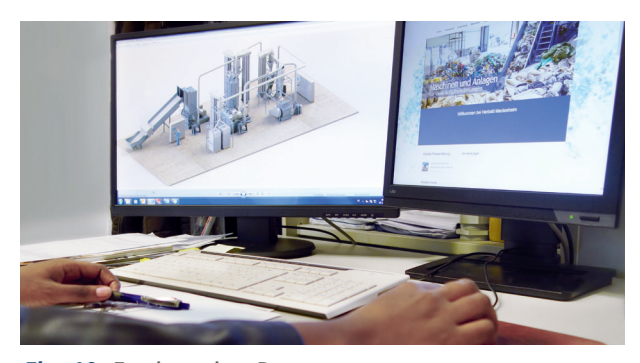
Fig. 10: Engineering Department

11. Our Project Department houses our engineering team who will work closely with you to help plan and develop your application into a fully functional running plant.