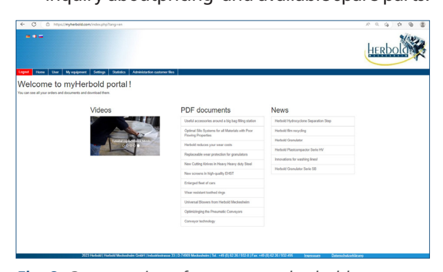
Fig. 8: Operator interface www.myherbold.com

9. HERBOLD Meckesheim has introduced a customer portal, http://myherbold.com where customers can access important information such as operator manuals, spare parts listings, and arrangement/electrical drawings for their specific machines. This portal can also be used to inquiry about pricing and available spare parts.