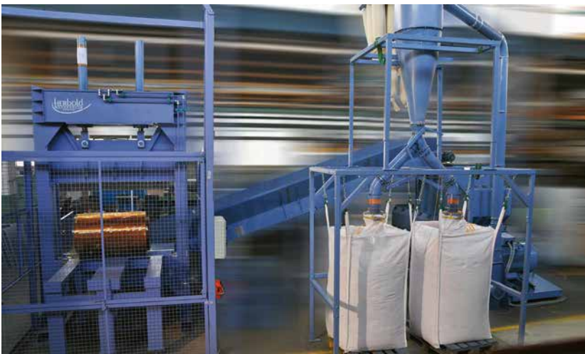
Fig. 3: Combination of guillotine and granulator with supply bunker

Safe handling of rolls that do not roll off, uncomplicated feed of cut sheeting parcels into the supply bunker of the granulator.