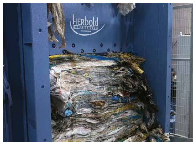
Fig. 2: Cutting the material portions lying under the cutting blade