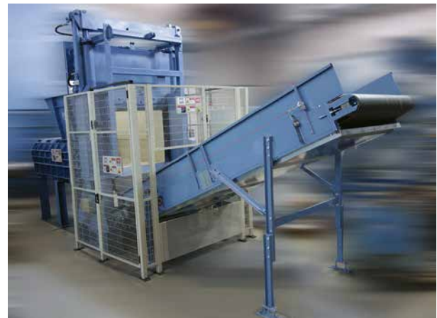
Fig. 1: Guillotine cutter HGS 150 with EWS hydraulic ram