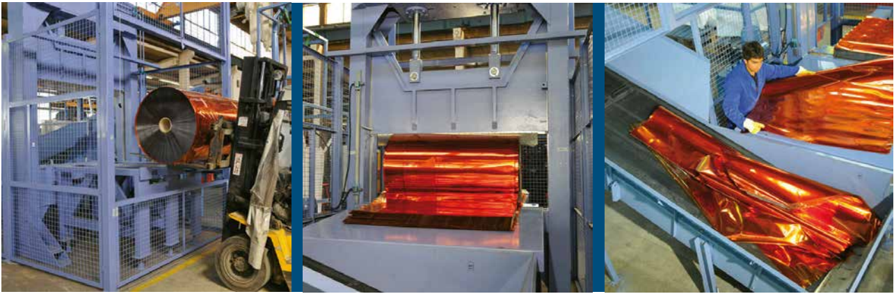
Step 1: Feed in of material is done via fork-lift truck