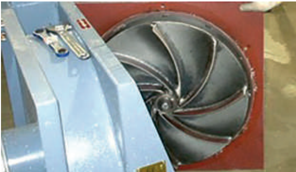
Fig. 7: The impeller has curved paddles that reduce wear and tear and prevent additional size reduction in the blower. Also available in heavy duty steel in the EHST series.