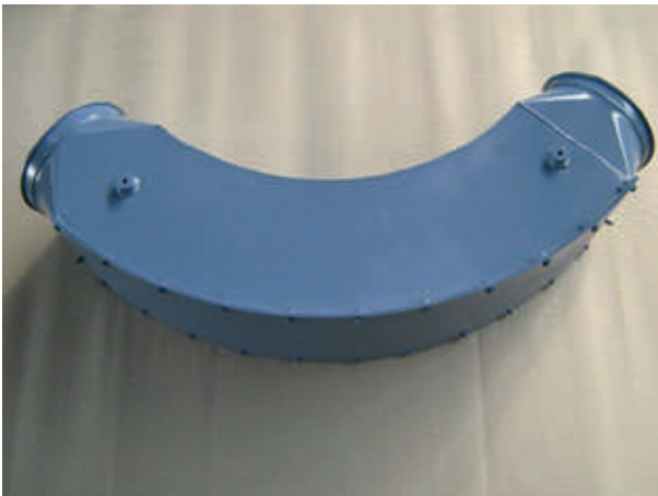
Fig. 1: The HERBOLD wear-resistant pipe elbows are prone to less wear than a traditional pipe elbow due to the larger radius.