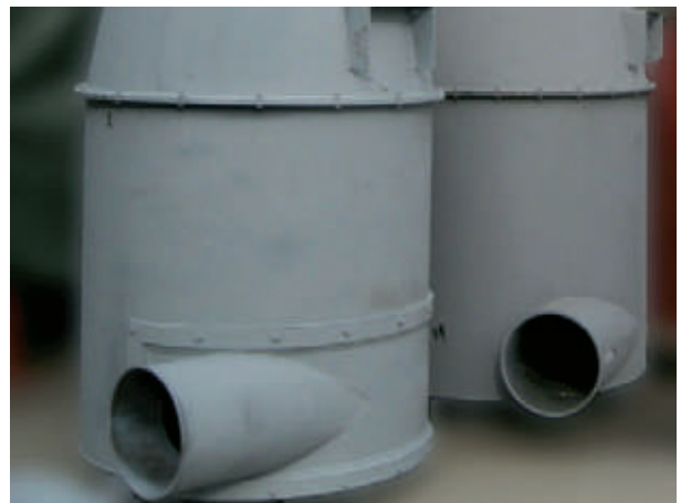
Fig. 4: The cyclone separator is available with and without exchangeable wear components.