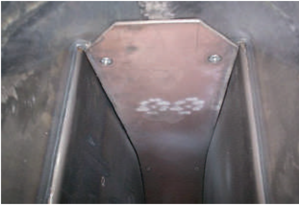
Fig. 5: The blowers are equipped with an exchangeable wear insert ...