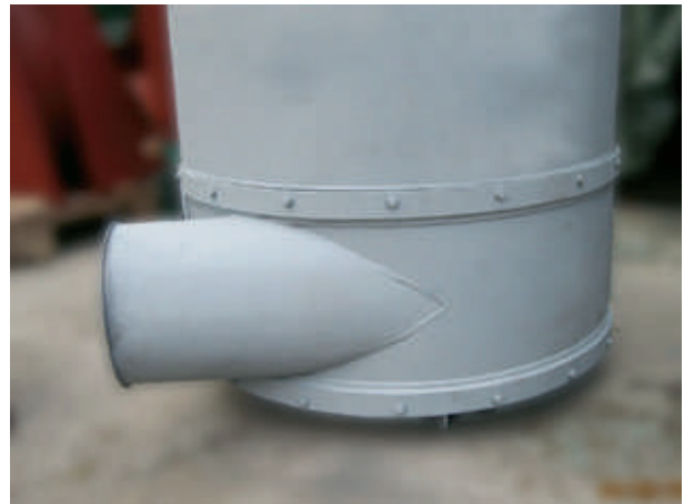
Fig. 3: HERBOLD also offers cyclone separators equipped with replaceable wear components .