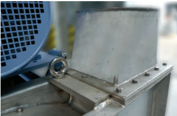
Fig. 6: ... as well as with exchangeable suction and pressure nozzles.