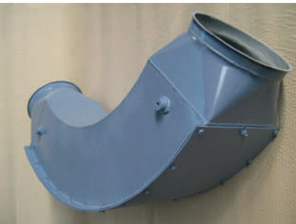
Fig. 2: These elbows feature exchangeable wear protection plates and allow the elbows to last longer and be used again.