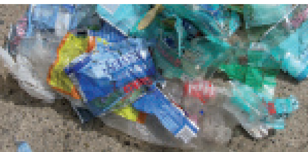
Fig. 4: Labels

Problem 1: With the usual prewashing steps it has not yet been possible to separate labels covering the whole surface of the bottle. With this type of labels, downstream NIR systems show an unsatisfactory separation performance. A separation during the subsequent steps is complicated, expensive and very often unsatisfactor.