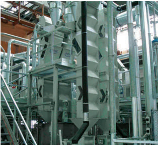
Fig. 1: Herbold air stream separator in a PET bottle washing line