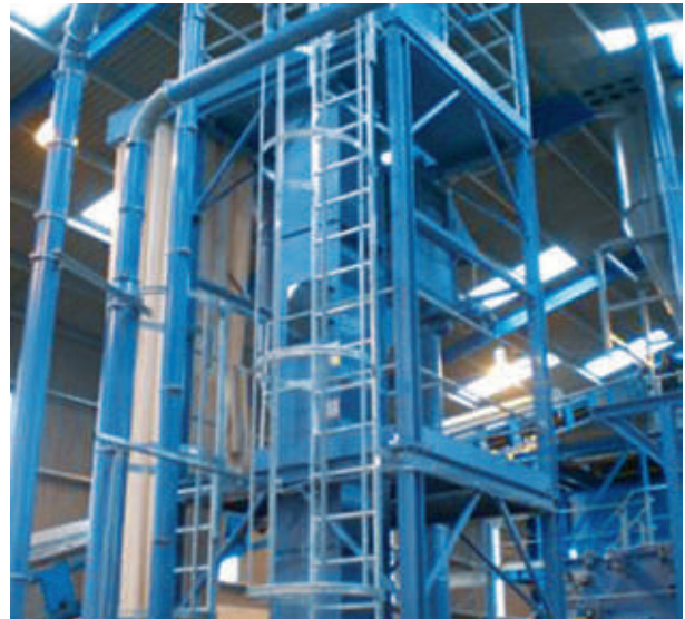
Fig. 2: Air stream separator with maintenance platform