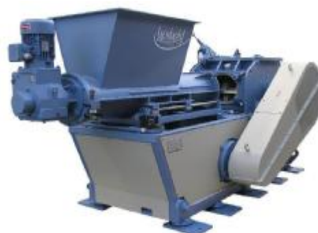
Fig. 4: Herbold Granulator Type SML SB