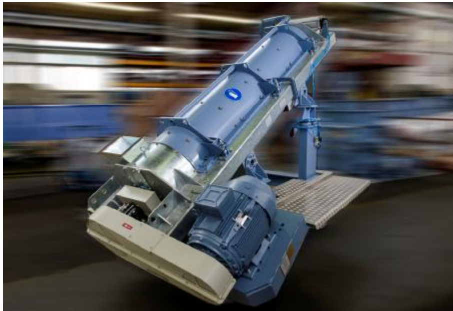
Fig. 2: Herbold Friction Washer Type FA 60/300

A new model of friction washers will be launched, the FA 60/300 type covering the performance range of 2 – 3 t/h for films and 4 – 6 t/h for rigid plastics.