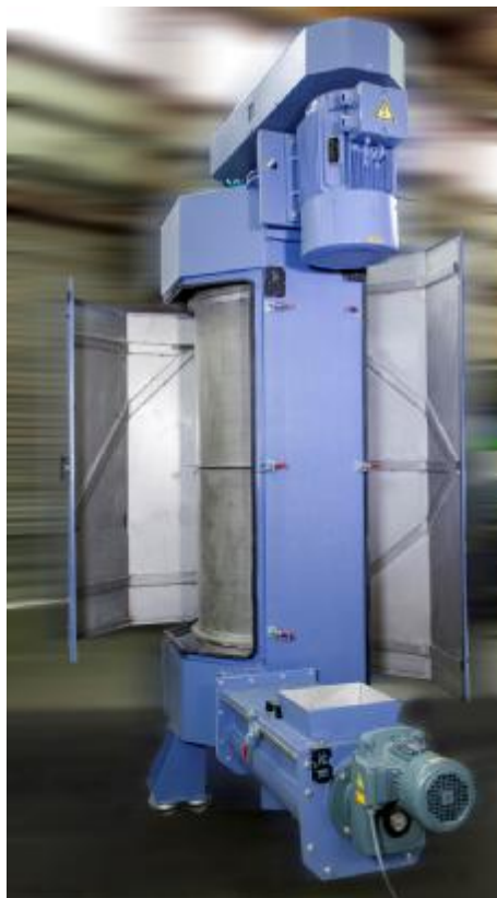
Fig. 1: Mechanical Dryer Type HVT

The new mechanical dryer (type HVT) with a vertical rotor arrangement is a particularly space-saving and extremely service-friendly version. Energy consumption is with certain materials such as PET flakes considerably lower than with former.