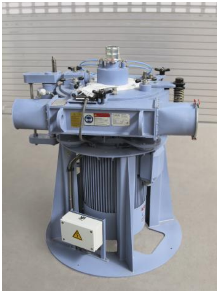
Fig. 6: Herbold Pulverizer Type 650

A machine of the medium performance range, the PU 650 with a vertical shaft will also be on display.