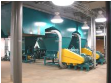
Fig. 1: SML SB 60/100

As energy savings is a hot topic in the news media and concern for consumers it seems quite logical to focus on these machines to improve their efficiency. HERBOLD has published several success stories with our forced feeding granulators, the SB series with increased efficiencies and power savings that a patent in the USA has been applied for based on their unique design. Two years after their commercial launch, as many as 80 machines of this series have been sold and the customer's feedback was unanimous: energy savings between 30 and 50% have been achieved. This means reduced operating costs and money savings in the amount of 15 to 25 thousand Euros per year with a 75 kW granulator operated in three shifts.