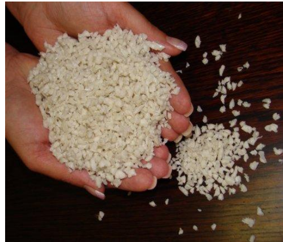
Fig.3 : Agglomerate